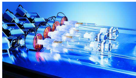
Fig. 1. "Zig-Zag" disk Laser consisting of a series of disk modules in a single cavity (TRUMPF [2]).

– a world leader in this class of laser systems – is presented at Fig. 1.